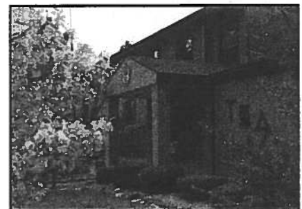
A Happy Valley Spring at TΦΔ