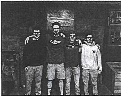
Spring 2018 Pledge Class