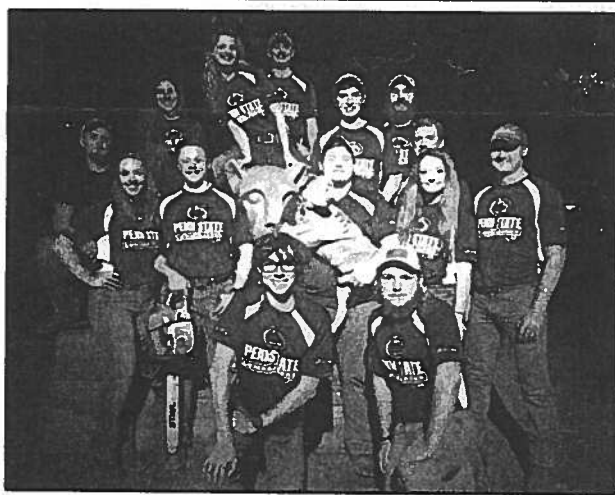
Recent PSU Woodsmen Team Included Several Brothers and Little Sisters

Visit us online at: www.tauphidelta.org & Follow us on Instagram at: tau_phi_delta_psu